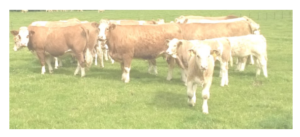
Pedigree Simmental Cattle

My biggest challenge has been finding affordable land to rent. It is very hard as a new entrant to compete against more established farmers who are willing to pay a high rent for land.