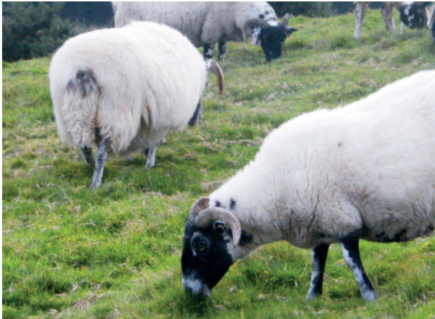
Figure 1: Pasture concentration of minerals is highly variable

Mineral deficiencies can be very localised. However, in parts of the UK, deficiency of certain elements including copper, cobalt, iodine and selenium, are prevalent.