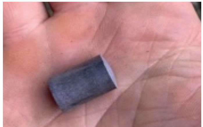
Figure 2: Rumen bolus

Oral drenching, rumen boluses, injections and pasture applications can be used to supplement selenium. Drenching is a relatively short-term method of control whereas boluses can last six months, and slow-release injections can last up to one year. Applying selenium to the sward may result in toxic levels for several weeks, making it unsafe to graze immediately.