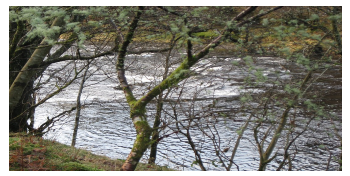
FES land for lease on the banks of the River Orchy

weighted favourably towards New Entrants. FES uses a transparent scoring system that looks at a number of criteria including New Entrant status. However, in some cases New Entrants may not be able to deliver our desired outcomes therefore the scoring matrix does not exclude more established farmers. For instance, a land parcel may need to be grazed with cattle for only a few months in late summer to meet environmental objectives — it would be unusual for New Entrants to have other land to move the cattle on to and many New Entrants do start out with sheep.