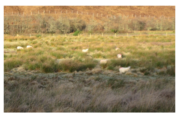
Jades Cheviot X Blackface are well used to the conditions in the area

"Buying from a local farm means you know what conditions the stock are used to" said Jade "The Hebrideans were from a hill flock that I knew to be very hardy and hefted to hill conditions and the Blackface X's were from my home farm with similar fields to my new place so no worries about them surviving the conditions"