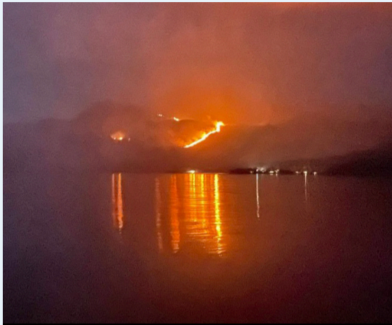
Wildfires are increasingly common

It is also useful that everyone in the local community with experience of fighting fires has each others telephone numbers so they can call for extra help.