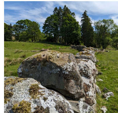
A traditional stone wall, showing early signs of dereliction and in need of restoration