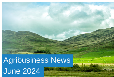
Agribusiness News June 2024

This article is part of the June edition of Agribusiness News. To find this article and more, please visit: