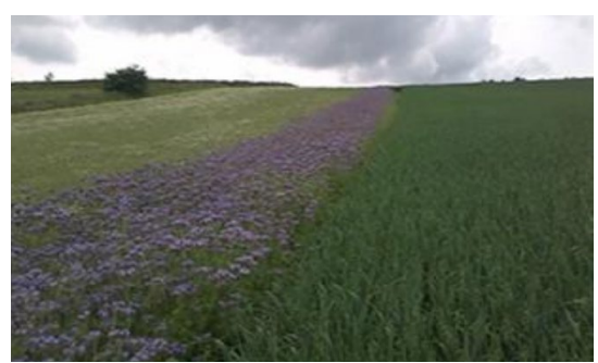
EFA fallow (examples of natural regeneration and a wild flower mix)