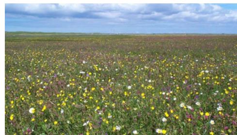
Example of Environmentally Sensitive Grassland

Note: The ratio of permanent grassland compared to the total agricultural area claimed must not decrease by more than 5%. The maintenance of this ratio will be monitored at a national level, not individual farm level.