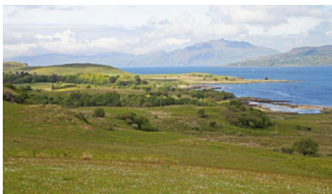
Example of Permanent Grassland