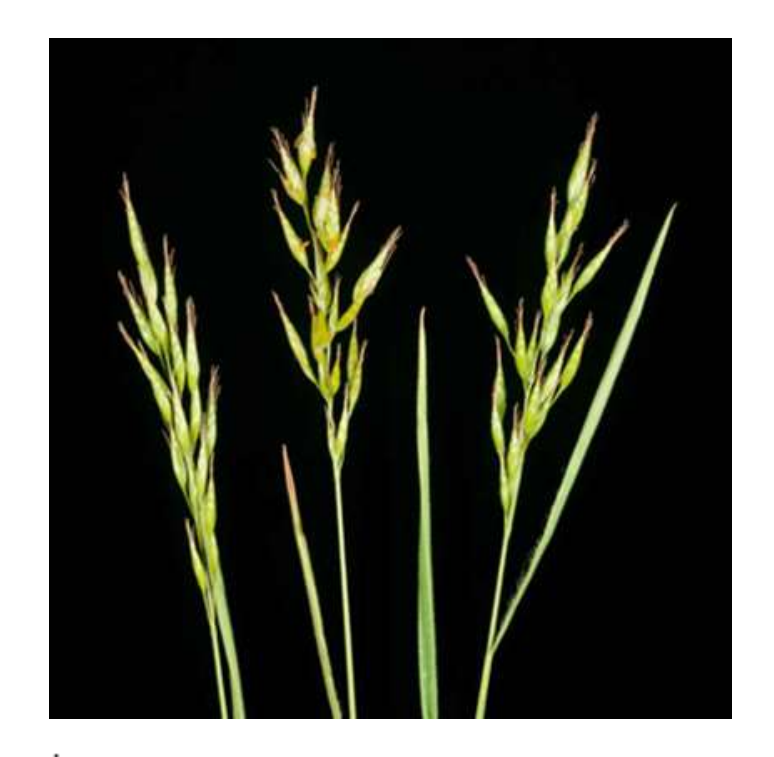
Image: http://www.bayercropscience.co.uk /your-crop/crop-diseases-weedsand-pests/grass-weeds/soft-brome/