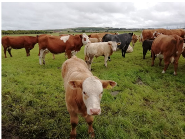
These cows have been grazing this field for a number of weeks