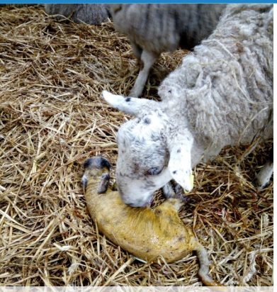
A lamb in distress may pass the meconium before birth, staining the fluids yellow.