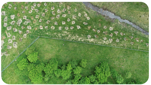
Creation of healthy riparian zones

Afforestation practices can be put in place anywhere across a catchment and will generally help limit water runoff. In the upper section they can be particularly effective as less developed areas allow for high planting numbers. New trees will naturally capture water within their branches as well as increasing soil porosity through new root infiltration into deeper soils. Increased soil porosity from deciduous tree planting will allow for up to 8 times the rainfall capture of pine plantations or grassland. This holds more water out of the rivers at the outset of a flood and will lead to lower peaks throughout a flood event. Advice should be taken when considering planting trees to ensure the species, land, and topography is suitable.