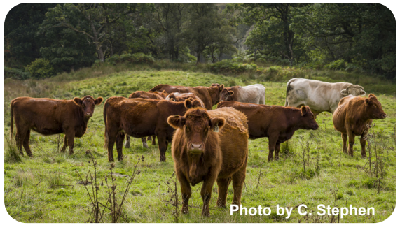
Improved livestock management