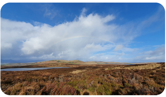
Peatland protection restoration