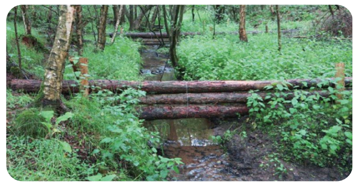
Leaky dam from the Designing and managing forests and woodlands to reduce flood risk: UK Forestry Standard Practice Guide

Along the erosion zones the installation of leaky dams is the most effective way for forcing flood flows into the adjacent floodplains where it will not damage downstream properties as well as rejuvenate adjacent farmland through new sediment deposition. These dams are simple to make and will result in significantly lower flood peaks further downstream.